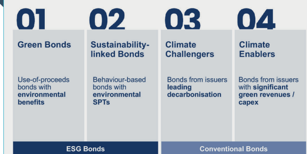
FIGURE 1: INVESTABLE UNIVERSE

The 'greenhushing' trend refers to a situation where companies remain committed to climate action but are less vocal about their efforts. While this decline in transparency is not ideal, we believe that discreet yet effective capital deployment is preferable to high-profile pledges with little meaningful follow-through. However, this shift also means that investors will need to conduct deeper financial analysis and engage more actively to identify the true and credible 'green gems' in the market.